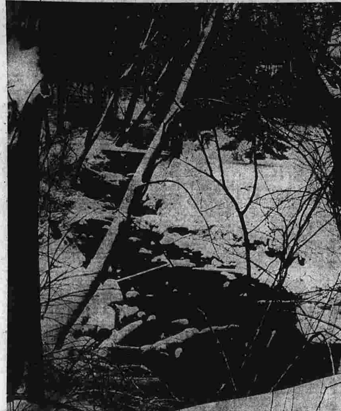
The stillness at Bigelow Brook and the surrounding woods was broken by the sound of a car horn as it passed. The trees were still, and the water was calm.